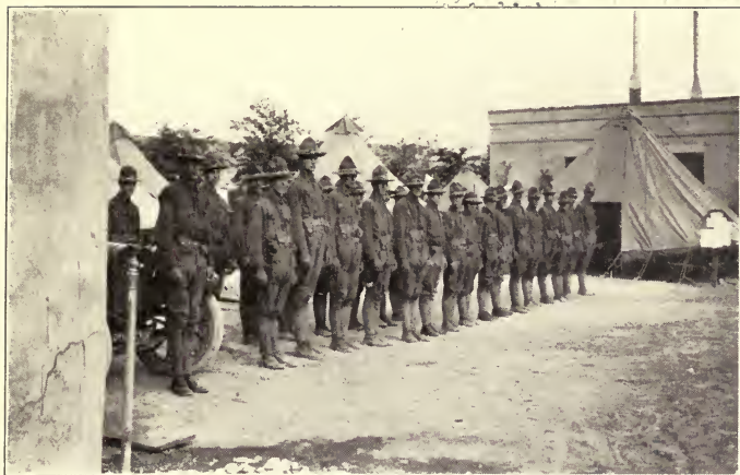
COMPANY AT RETREAT